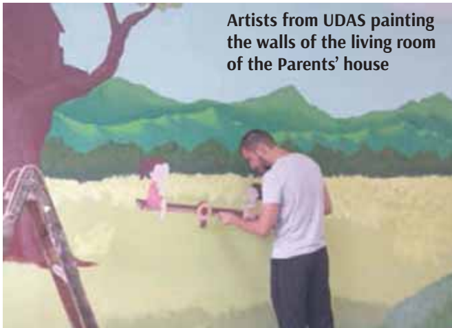
Artists from UDAS painting the walls of the living room of the Parents' house