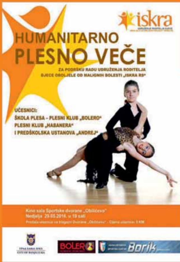
Dance club “Bolero” held a charity dance evening on May 29 in the sports hall “Obilicevo” in support of the work of the Association of Parents of Children with Malignant Diseases “Iskra” RS.